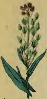
Gold of Pleasure